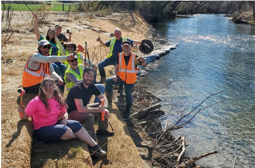
Mills River Park Riverbank Restoration Live Stake Planting Volunteer Day