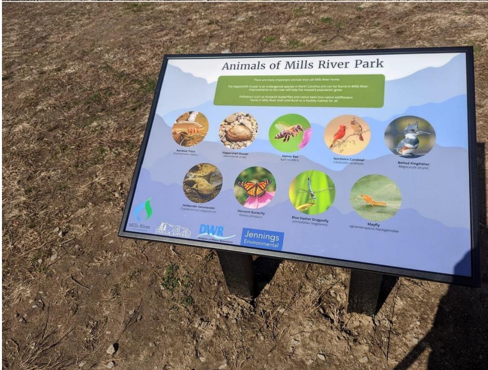
Educational signage installed at Mills River Park.