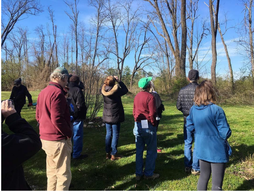
Birds of Mills River Audubon Walk