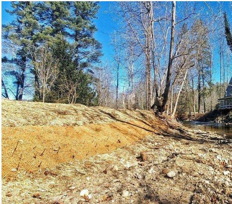
Riverbank repair on the South stem of the Mills River. Weeks residence.