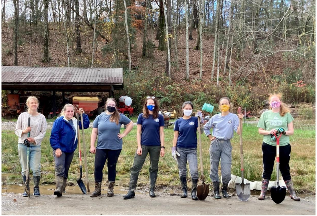
Volunteers transplanting Juncus to the banks of the newly restored Foster Creek for a quick jump on stabilization with hardy roots.