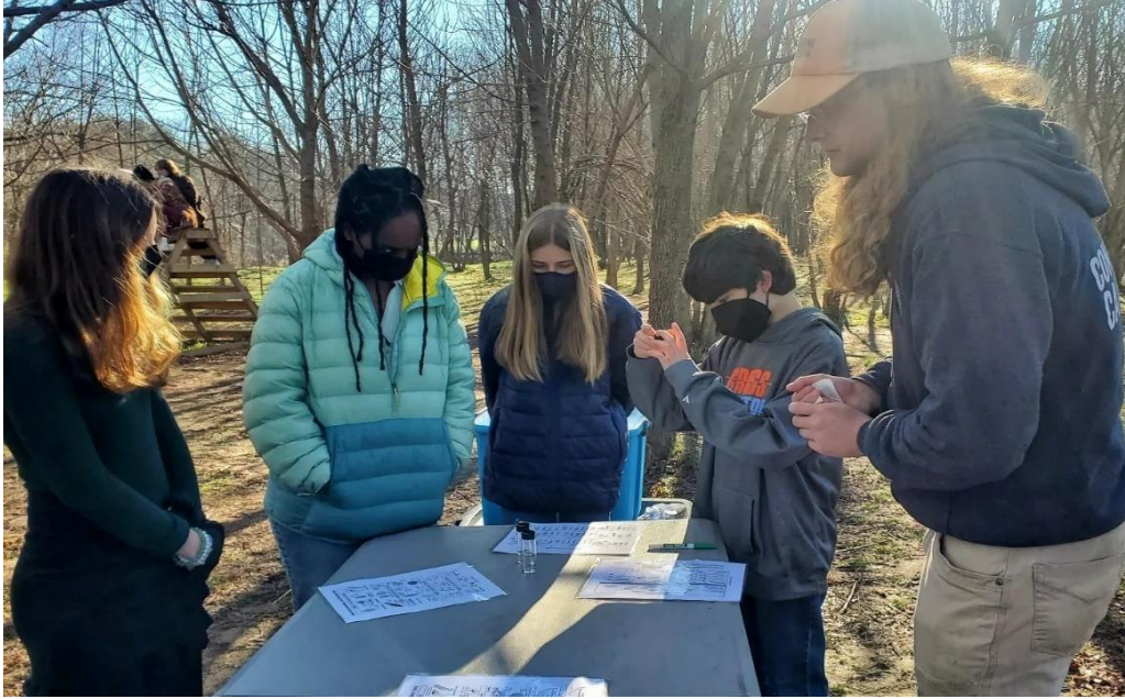
How to identify and key macroinvertebrates with Franklin School of Innovation