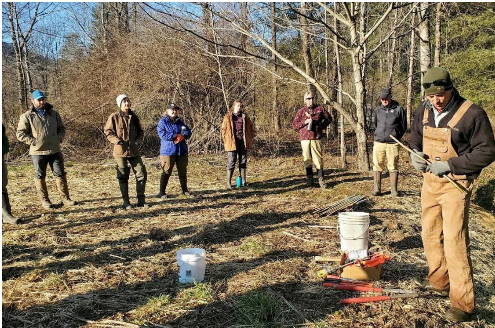
Streambank Repair Certification class in partnership with NC Cooperative Extension.