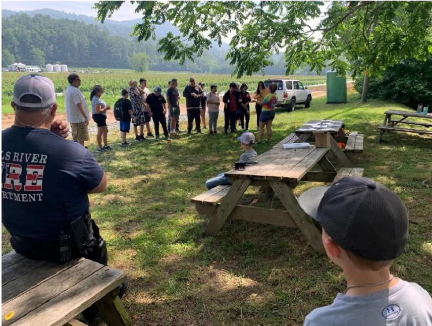
Middle School Students learn about water quality at "Careers in Agriculture" day. North River Farm