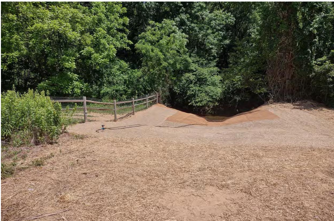
Lugo After: Grassed waterway to carry water and empty to the Mills River without erosion in the field or at the outfall.