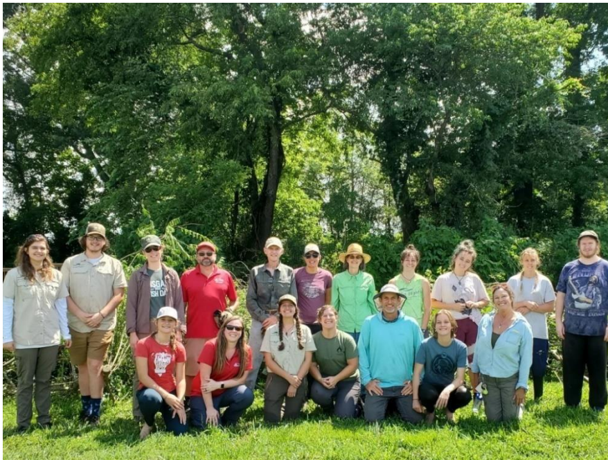
Invasive Removal Workshop with Pisgah River Rangers and Sierra Nevada