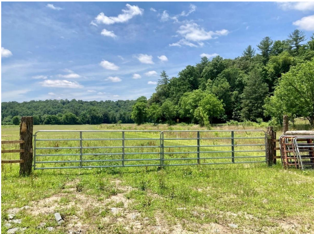
Over 800 feet of livestock fencing installed to protect Foster Creek and the riparian buffer.