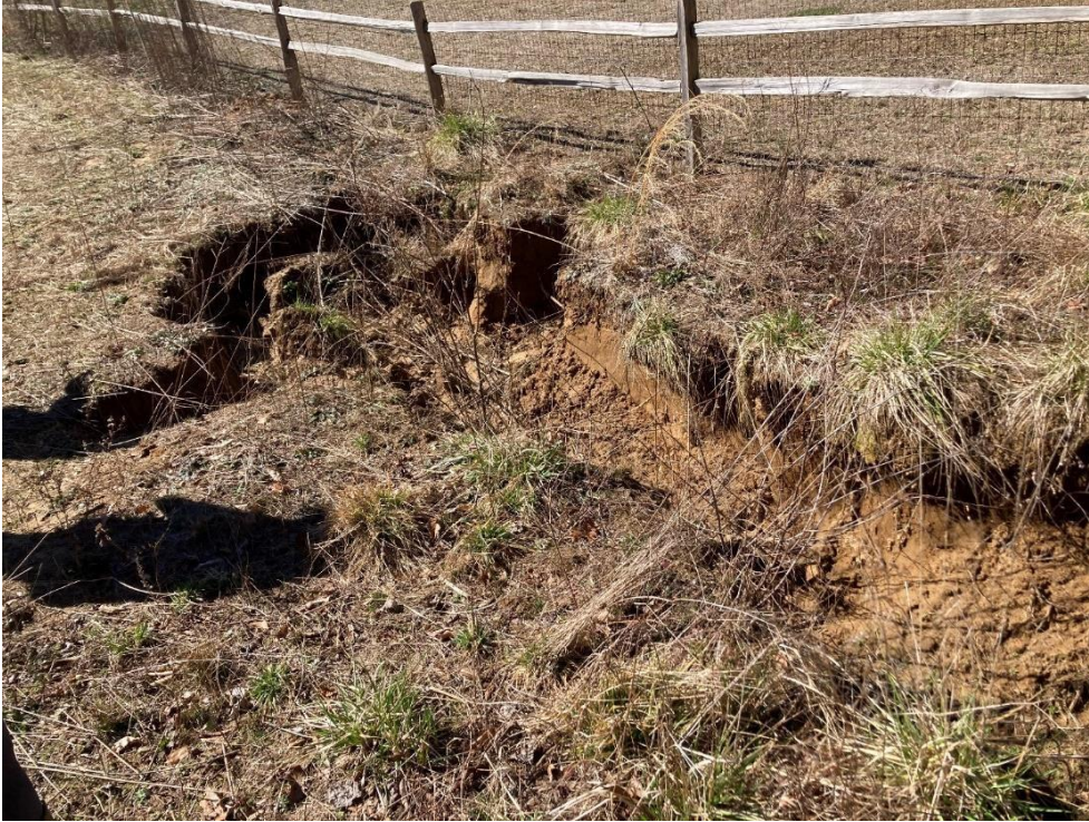
Lugo Before: Erosion in pasture leading to the Mills River.