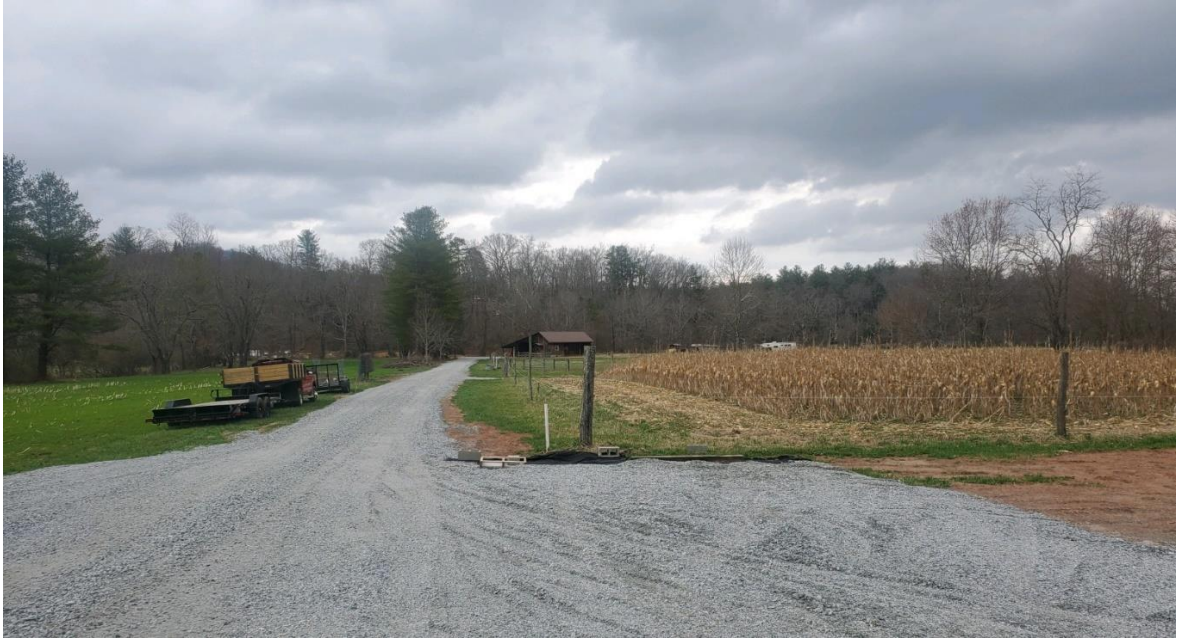
Lugo After: Farm road rutted and eroding with steep slope at top, now stabilized with filter cloth and thick gravel, saving sediment from entering the river.