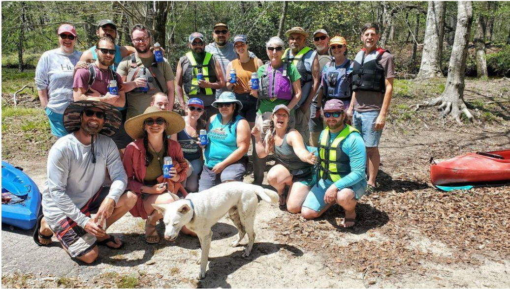
River Clean Up 2022